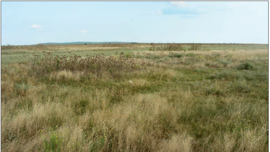
Fig. 4. Steppe area at Sarinasuf-Plopu (Tulcea county, northern Dobrogea), 27.viii.2008.

Europe, the west-asiatic steppes, Asia Minor and the east of the Balkan Peninsula. Therefore, Dobrogea represents the western distributional limit for several Lepidoptera taxa being characteristic for the south Ukrainian steppes, for example Megaspilates mundataria (Stoll, 1782), (Geometridae), Cucullia biornata Fischer v. Waldheim, 1840, Saragossa siccanorum (Staudinger, 1870) (Noctuidae).