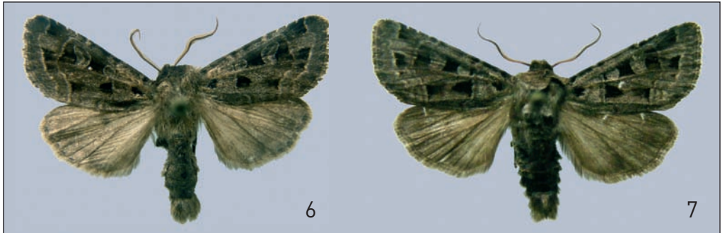
Figs 6–7. Saragossa porosa porosa . 6. Male of Saragossa porosa porosa Sarinasuf-Plopu (Tulcea county, northern Dobrogea), 26.v.2008. Photo L. Székely. 7. Holotype of Saragossa porosa kenderesiensis , Kenderes (Hungary), 20.v.1964. In coll. Hungarian Natural History Museum. Photo L. Székely.