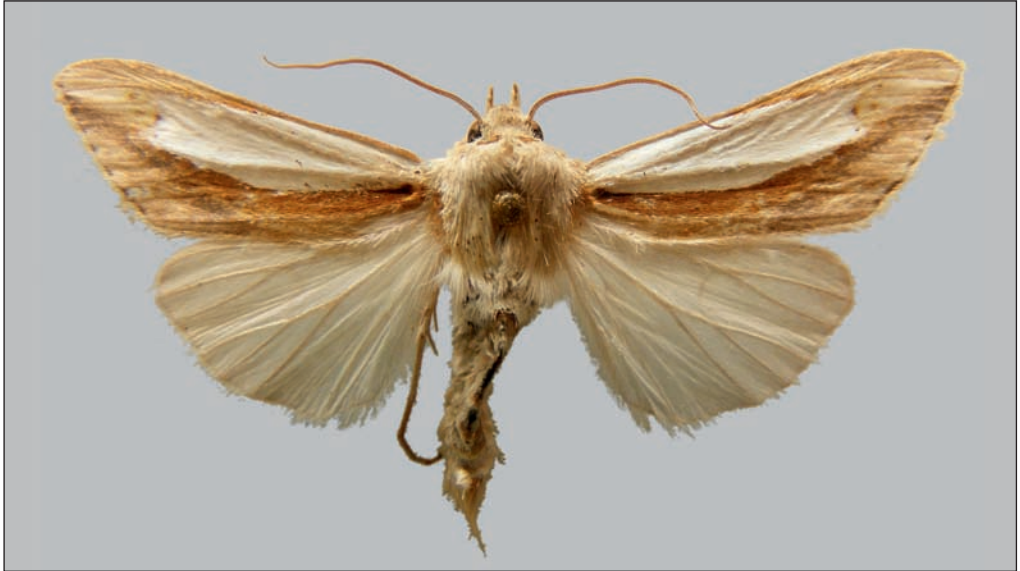
Fig. 5. Male of Cucullia argentina , Sarinasuf-Plopu (Tulcea county, northern Dobrogea), 2 m, 24–27.viii. 2008.

argentina such as: achalina Pungeler, 1900 (type locality Ashabad, Turkmenistan) and grisescens Wagner, 1931 (type locality Akşehir, Turkey). The name grisescens Wagner, 1931 being preoccupied by Cucullia grisescens Leech, 1900, has been replaced by anatoliensis Koçak, 1980 (Ronkay & Ronkay 1994). The subspecies anatoliensis was subsequently treated as synonym of the nominotypical subspecies (Hacker 1990; Ronkay & Ronkay 1994, 2006). Concerning the subspecies achalina , recent data suggest that this is in fact a distinct species so that C. argentina appears in its nominotypical subspecies throughout all its range (László Ronkay, pers. comm. 2009).