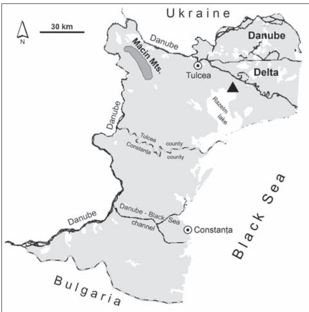
Fig. 2. Map of Dobrogea indicating the collecting site (Sarinasuf-Plopu, Tulcea county – black triangle) of Cucullia argentina and Saragossa porosa porosa .