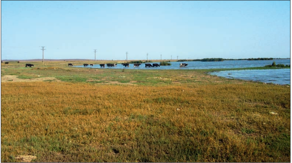
Fig. 3. Sarinasuf-Plopu (Tulcea county, northern Dobrogea) (26.viii.2007). The Artemisia steppe is the optimal habitat for Cucullia argentina and Saragossa porosa porosa .